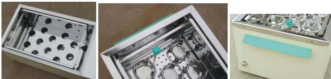
Mirror-finished Stainless Steel Bath Tank Interior

The latest ZHWY-110X Reciprocating Water Bath Shaker combines unmatched reliability and durability. It delivers superior temperature control and uniformity with a smooth shaking motion. Bath temperature is controlled to an accuracy of \pm 0.1^{\circ}\text{C} by a PID temperature controller for optimum, reproducible bath conditions. Dual thermostats provide optimum protection for your work and water bath. The steeply gabled cover and inward-sloped tank rim allow condensate to drain neatly back into the bath, preventing condensate from dripping onto samples.